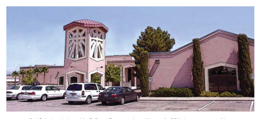
Del Sol church, based in El Paso, Texas, replaced its costly PBX phone system with a D-Link VoiceCenter VoIP solution.

installed the D-Link DVX-2000MS-10 VoiceCenter™ IP Phone System 10-Phone Kit for Microsoft® Response Point™ and 7 additional DPH-125MS phones. The system supports 50 total users. "Availability and pricing is much more attractive